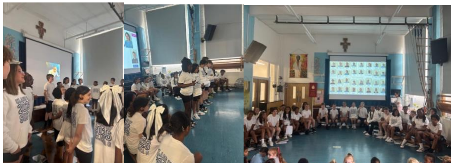
Year 6 Leavers Poem

Year 6 gave their final assembly to an emotional audience on Thursday. It was a fitting send off for this amazing cohort. We hope they will all come back to visit us in September.